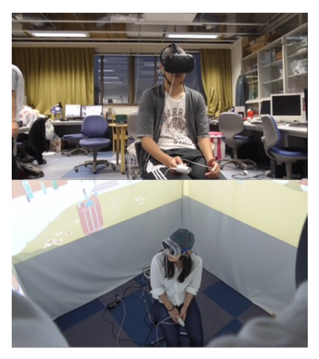
Fig.1 (Upper) HMD and (lower) SCREEN-GOGGLE, which restricts the vision of the user by applying goggles.

B-Con Plaza, Beppu, Japan and ONLINE, January 25-27, 2023